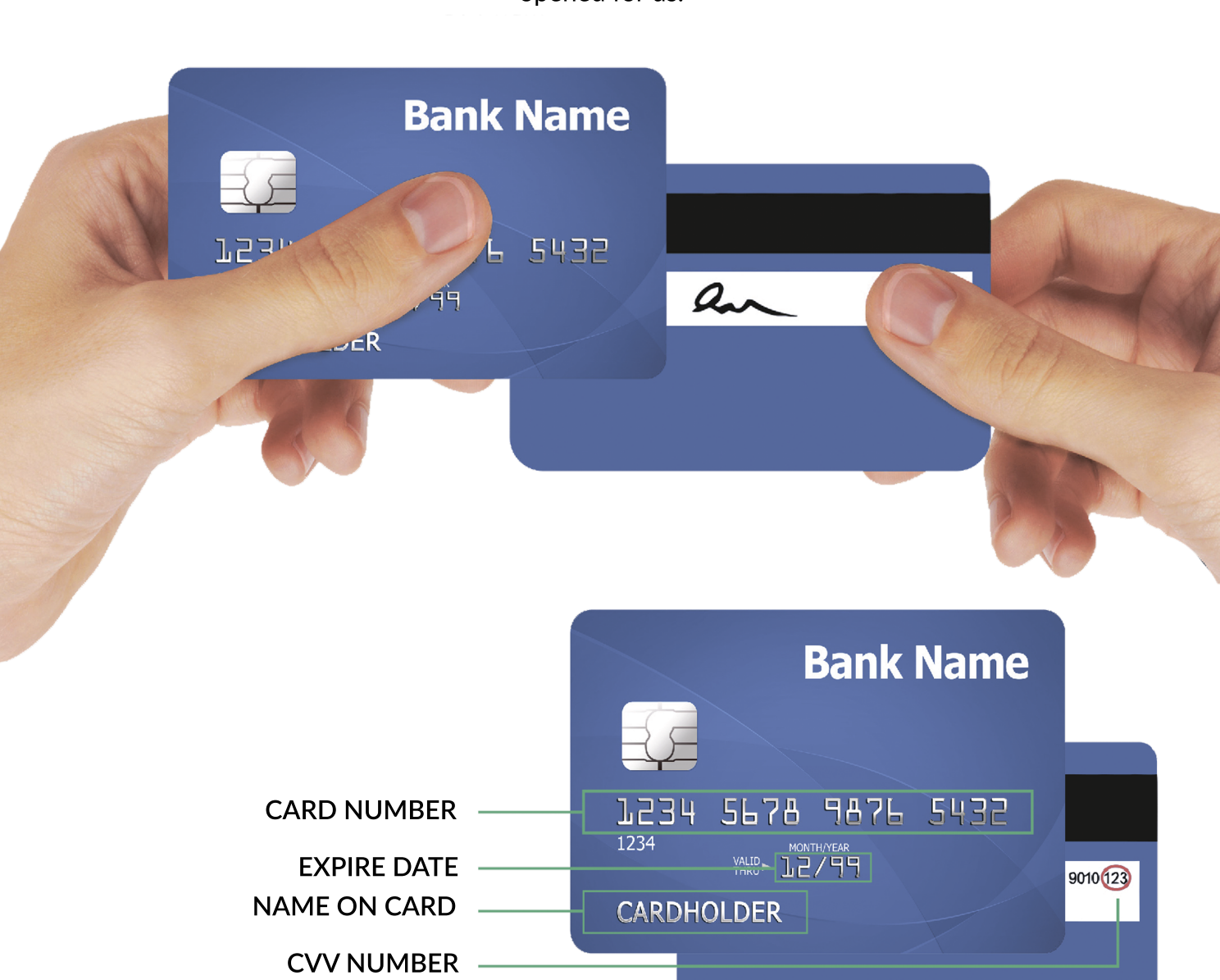
Photo of both sides of the credit/debit card used for the payment. The first four digits of your card number and last four digits on the front side, the expiry date on both sides of the card and your signature should be visible. The CVV and eight digits in the middle of the card number should be hidden. In the example below, you'll see the card's areas that should be opened for us.

IMPORTANT: please NOTE that all documents should be in a good quality, colored, readable, full-sized, with all borders and corners visible (so please leave more space at all sides of the document, even 5mm from the border of the document, will be enough)